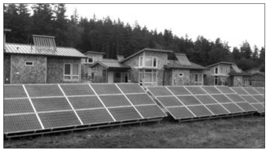
Common Ground and solar array