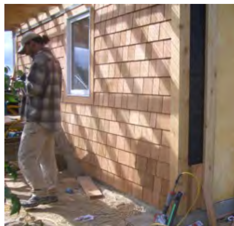
House C replaced wall