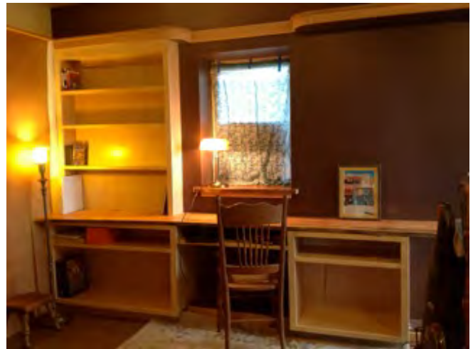
New wall interior, House A