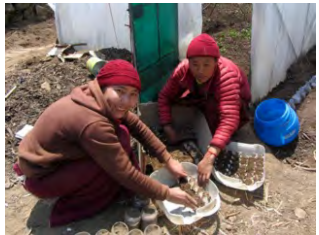
Buddhist nuns planting in Nepal