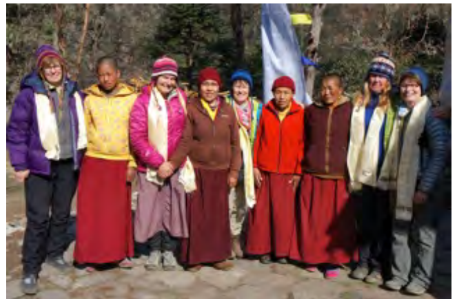
Buddhist nuns with supporters in Nepal