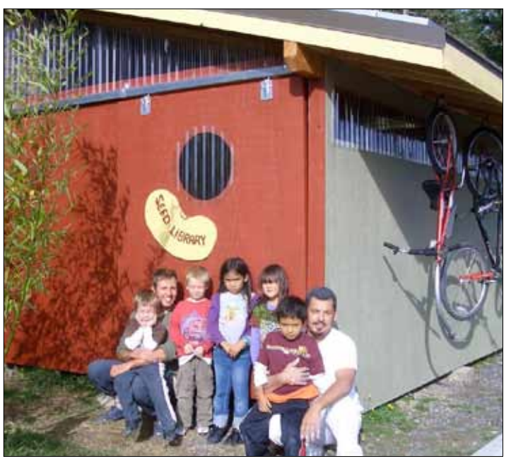
Seed Library in Process

The neighborhood, just northeast of Common Ground, will be comprised of two duplexes, similar in design. We will continue with solar hot water,