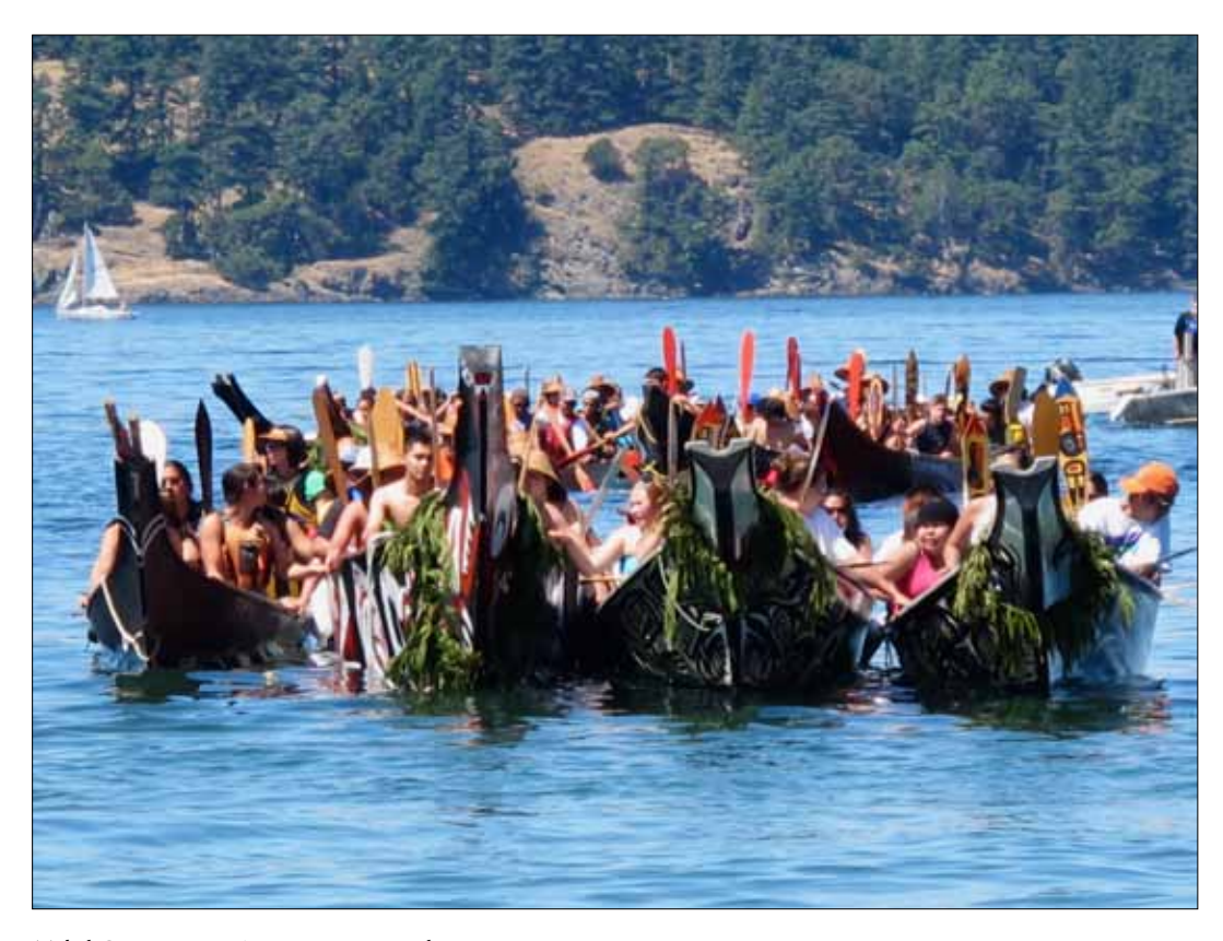
Tribal Canoe Journey Arriving on Lopez July 2011