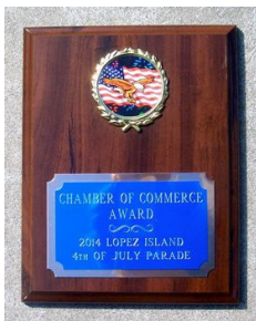
Chamber of Commerce 4th of July award