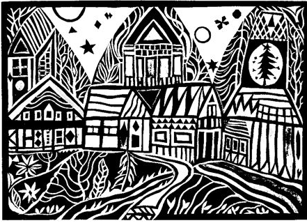
A Dream of Houses