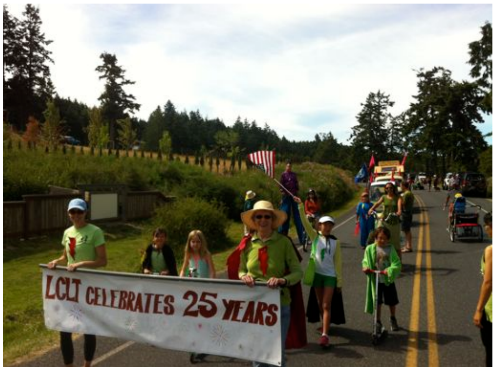
LCLT'S 4th of July entry