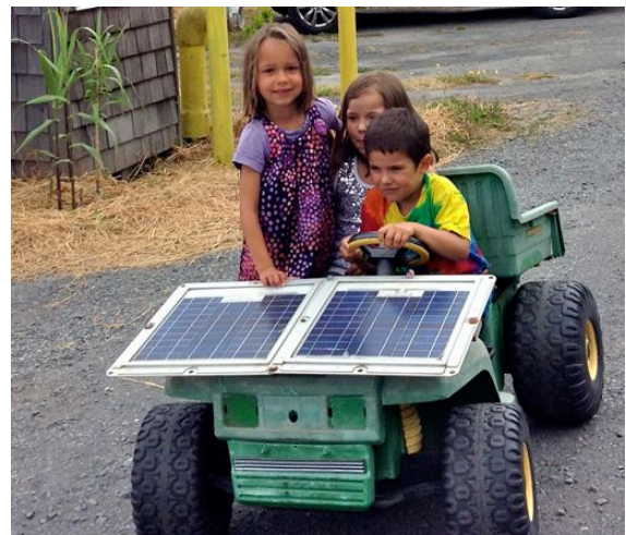
kids in the neighborhood

What keeps us going is your generosity to this organization, the children's smiles as they bound down the road outside our office window, the small businesses of homeowners in our affordable housing neighborhoods that nurture community on Lopez and the faces of our interns as they grow empowered and hopeful for their own futures.