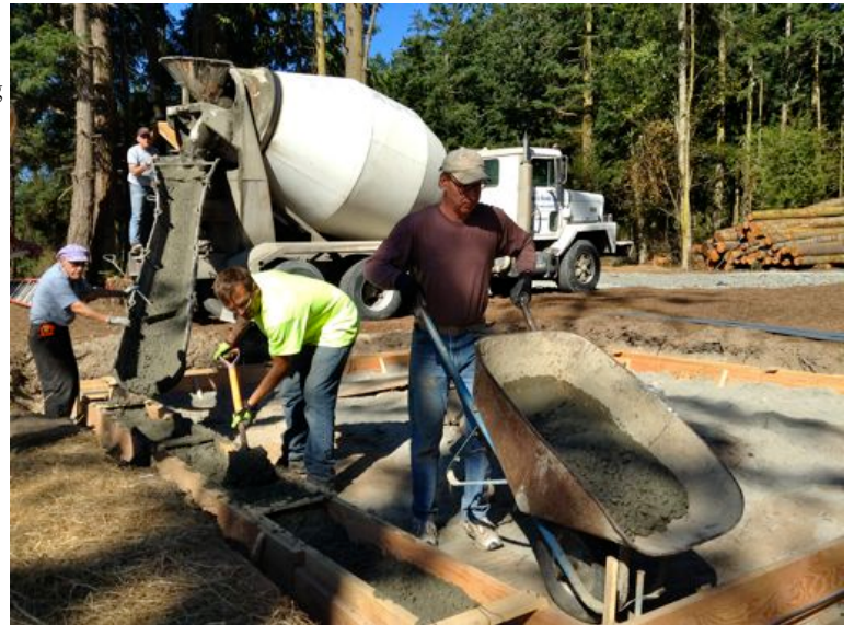
Salish Road construction

We have much to be proud of in 25 years of accomplishments, but we are sobered by the fact that single parents, the elderly and young families are entering our office doors in search of affordable housing that we don't yet have. We have young farmers seeking stable housing and farmland. We have college graduates who can't find jobs, and have chosen to intern with us doing meaningful work, rather than sitting idle or working for minimum wage or for corporations that challenge their personal integrity. We see students in our school systems loving local food, and yet realize they are shortly to be catapulted into a world where government-subsidized,