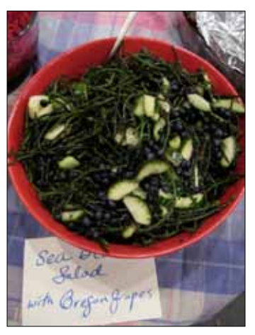
Winning dish at Harvest Dinner

Finally, LCLT has been published internationally with an article in a Japanese softcover called BIOCITY 2011 . Unfortunately for us, except for the recognizable photos, the article is entirely in kanji (Japanese characters).