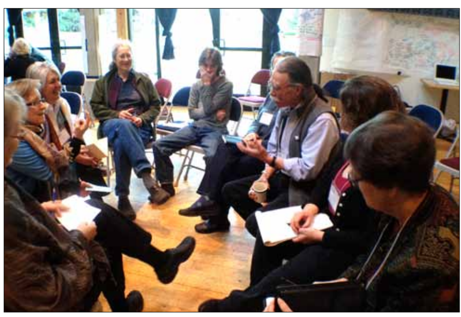
Thriving Communities Conference at Whidbey Institute

Last month LCLT was invited to attend the first annual Thriving Communities Conference at the Whidbey Institute. This conference focused on food systems and "Cultivating Community in Challenging Times." We were asked to explore with them: how do we meet the growing critical needs of individuals, families, and communities? How do we nurture a sense of