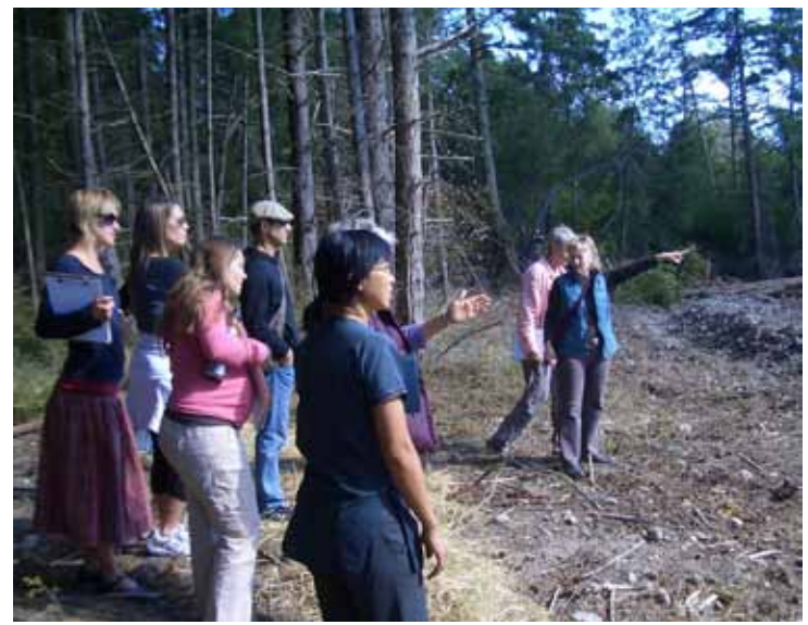
New homeowners surveying the building site

The National Conference of Community Land Trusts