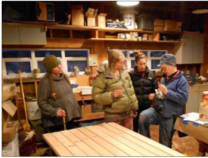
New homeowners finish thier picnic table

Plans for Tierra Verde, our fifth housing cooperative, reflect the best parts of Common Ground design and changes based on lessons learned. The four houses, to be built in a small clearing to the northeast of Common Ground on the same parcel, will be snug, efficient, light-filled, beautiful and affordable. LCLT had received numerous inquiries for housing from young families and felt that, despite today's tight economy, we could manage funding for four homes. These young families reflect a changing demographic served by LCLT.